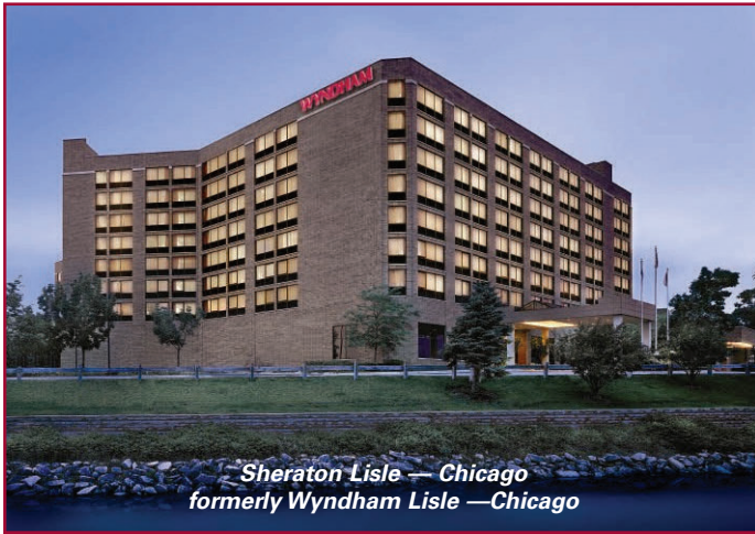
Sheraton Lisle — Chicago formerly Wyndham Lisle — Chicago